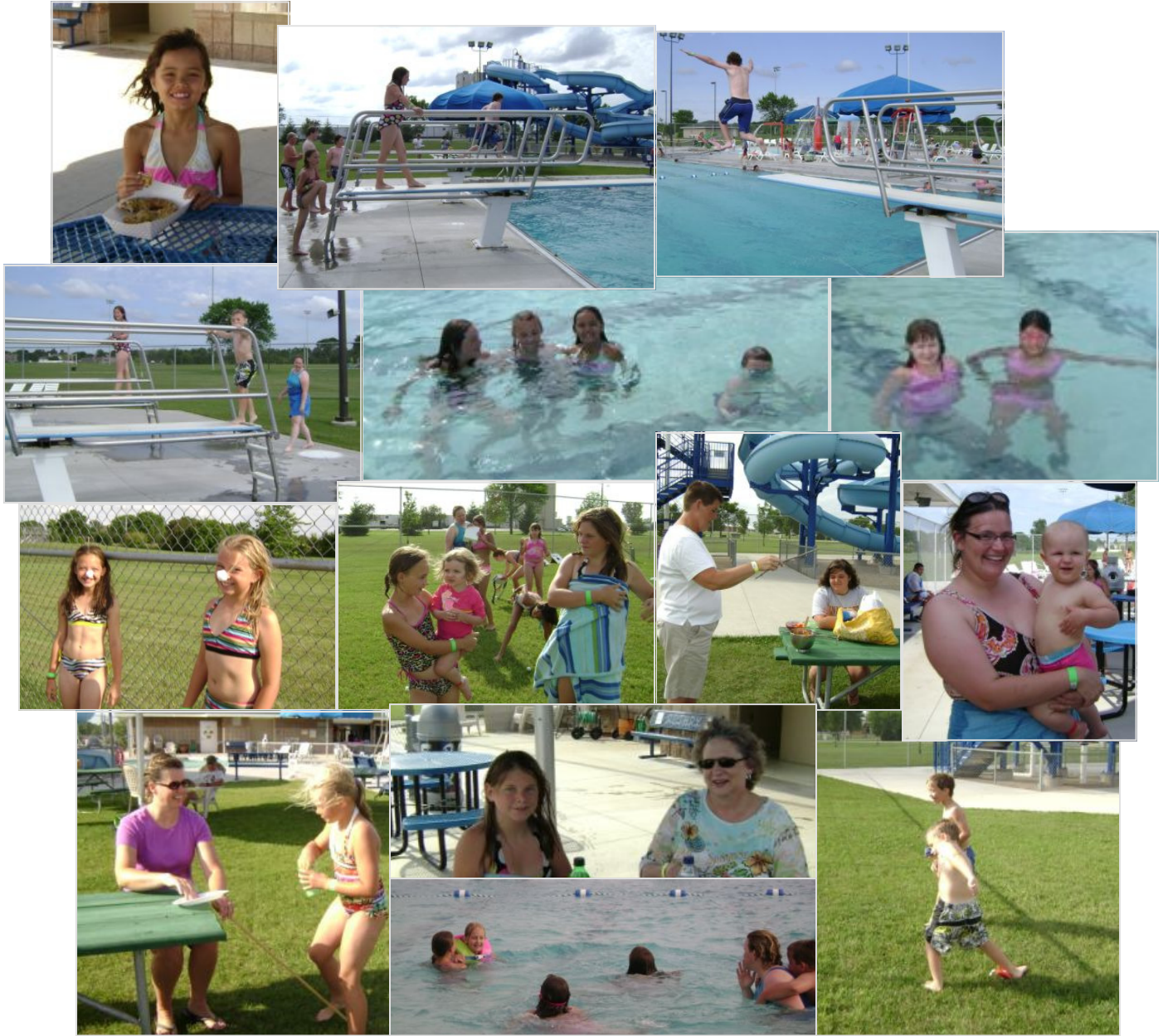
Canon balls, water up the nose, pizza pretzels, games with gummie worms and cotton balls stuck on noses with Vaseline. A good time was had by all at Calvary's Fun Day, July 13.